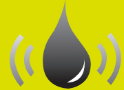
Fresh or Salt Water Activated (C-Strobe™ H 2 O Only)