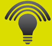
LED Strobe Light